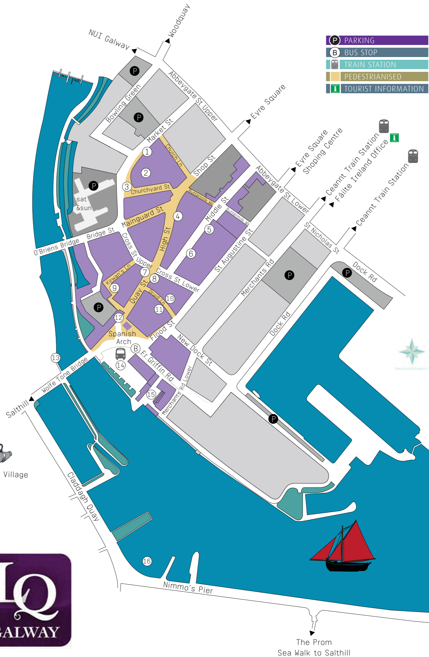
The Prom Sea Walk to Salthill